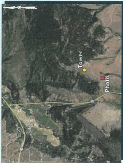
Photo Location 8560 Elk Springs Rd Ellensburg, WA 98926