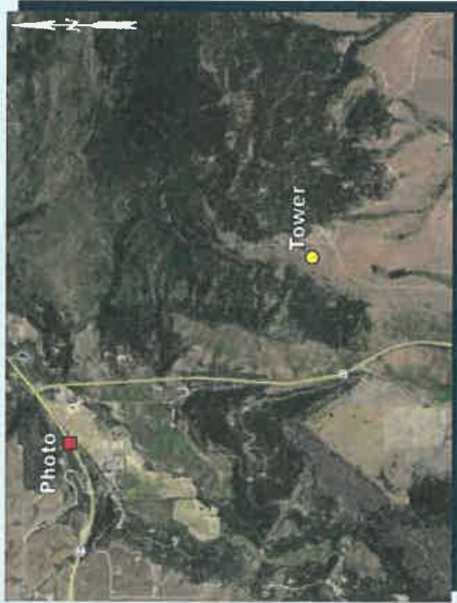
Photo Location 8560 Elk Springs Rd Ellensburg, WA 98926